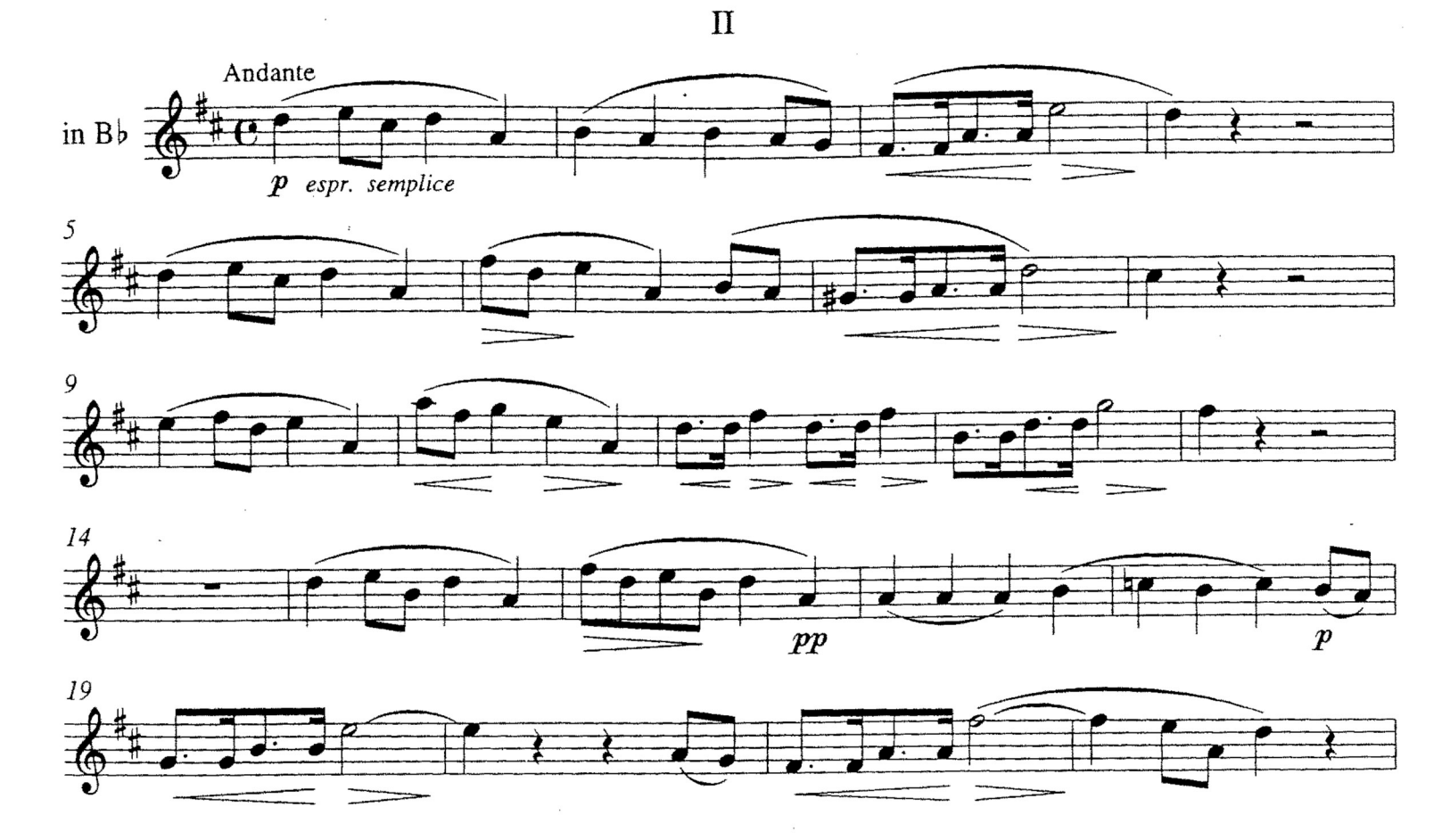
Beethoven, Symphony No. 6