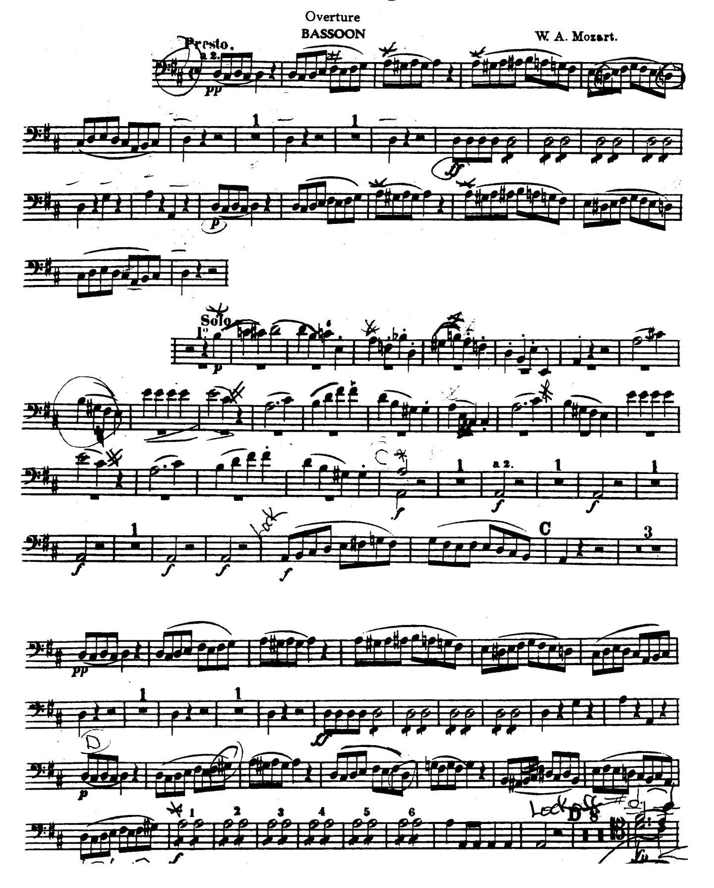
The Marriage of Figaro