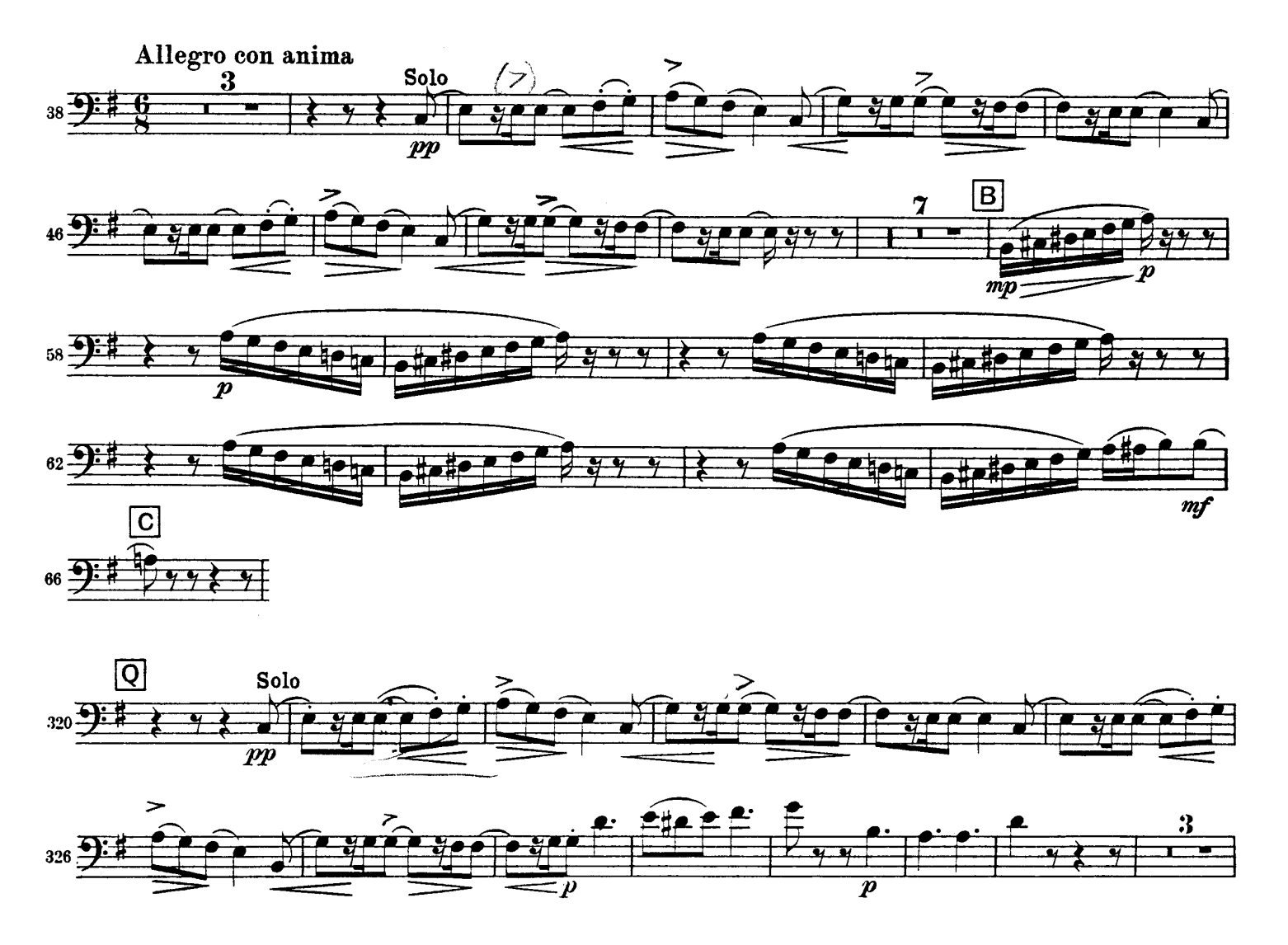
Tchaikovsky, Symphony No. 5, III - Bassoon I